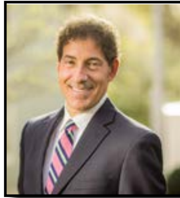
March Speaker Congressman Jamie Raskin